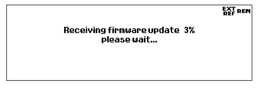
Figure 6. GSG Receiving Firmware Update

NOTE: Version 4.3.0.4 of StudioView software sends a final query after upload that older firmware cannot respond to. This will result in StudioView displaying an error that the firmware update failed ('Failed: Device has not replied in time: *WAI, ErrCode: 0xBFFF0015'). If the unit screen looks like Figure 7 (firmware is updating) then the file did successfully transfer.