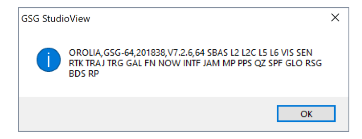
Figure 5. IDN Query Reply

screen. The response should look like Figure 5 with the appropriate serial number and equipment information.