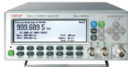
Figure 4: Display showing different statistical parameters viewed at the same time.