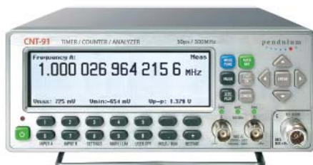
Figure 3: Input parameter setting menu shown with measured result.