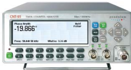
Figure 1: Display showing phase value, frequency, attenuation Va/Vb, and auxiliary parameters.