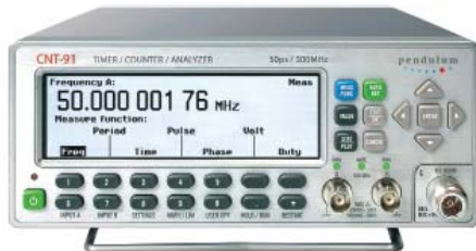
Figure 2: Measure function selection menu, shown with measured results.