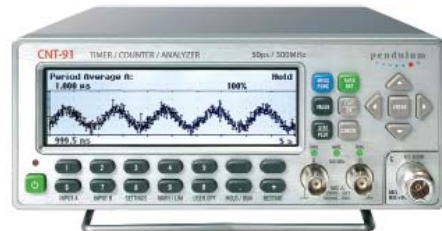
Figure 5: Display showing the trend (signal over time) of sampled data.