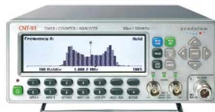
Figure 6: The same result as in Figure 5, now displayed as a histogram.