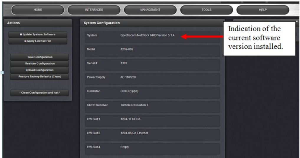
Figure 1: Software revision reported in the Tools -> Upgrade/Backup Page

A) Using the new Web UI (Software versions 5.1.0 and above) Log in to the unit's Web UI. Click on "Tools", then "Upgrade/Backup". The "System Configuration" table on this page contains a "System" field. The number next to this is the current Archive software version: