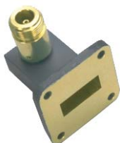
Waveguide Adaptor Acc 334

Waveguide-to-Coax Adaptor WR-75 to N-type (f) (10.0-15.0 GHz)