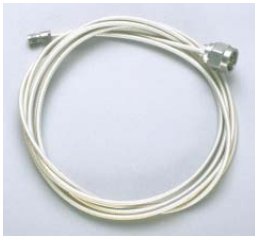
Coax Cable Acc 329