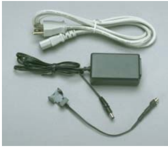
Battery Charger Acc 321