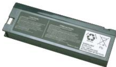
Spare Battery Acc 320

Spare Battery 12 V, 2.3 Ah Rechargeable Sealed Lead/Acid Battery