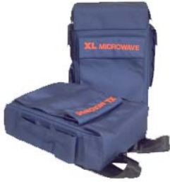
Path Align-R Backpack Acc 336