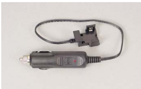
Vehicle Adaptor Acc 323