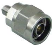
Coax Adaptor Acc 325