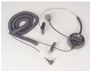
Headset Acc 327