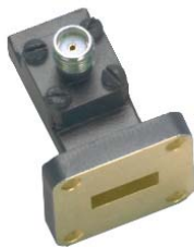
Waveguide Adaptor Acc 333

Waveguide-to-Coax Adaptor WR-42 to SMA (f) (18.00-26.50 GHz)