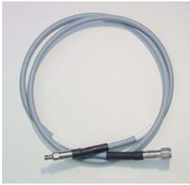
Ruggedized Coax Cable Acc 338

Ruggedized Coax Cable Low-loss (less than -2dB to 20 GHz) SMA (m) to N (m) Length: 72 inches