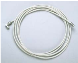
Coax Cable Acc 324