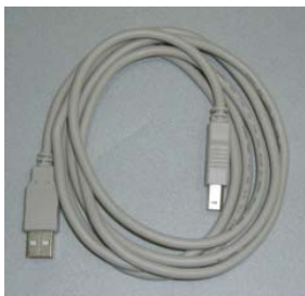
USB Cable Assy Acc 341

USB Cable Assy USB "A" (m) to USB "B" (m) Length: 6 feet