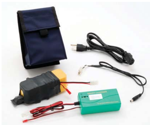
Cold Battery Pack Acc 400