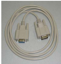
RS-232 Cable Assy Acc 340

RS-232 Cable Assy DB-9 (m) to DB-9 (f) Length: 6 feet