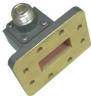
Waveguide Adaptor Acc 332

Waveguide-to-Coax Adaptor WR-112 to N (f) (7.05-10.0 GHz)