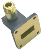
Waveguide Adaptor Acc 331

Waveguide-to-Coax Adaptor WR-90 to N (f) (8.20-12.40 GHz)