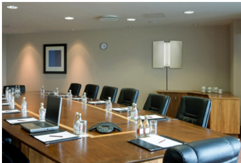
Decorative cover is ideal for use in conference rooms and office spaces

Even though synchronizing network master clocks and time servers to GPS is well-known as the standard for the most time-sensitive applications, some data centers and critical server locations are not conducive to traditional roof-top GPS antenna installation. Skylight™ provides a solution. Consisting of an indoor GPS antenna panel, a configuration of Spectracom's SecureSync® modular GPS time server, and an interconnect cable, Skylight opens new possibilities for accurate GPS time.