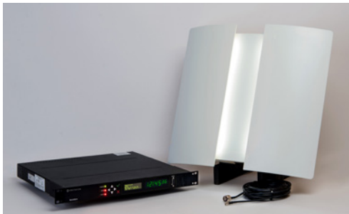
Skylight includes indoor GPS antenna panel, cable, and SecureSync GPS time Server